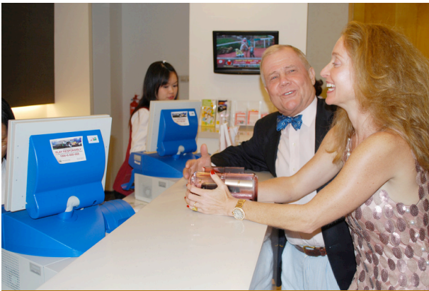
Our happy guests placing their bets