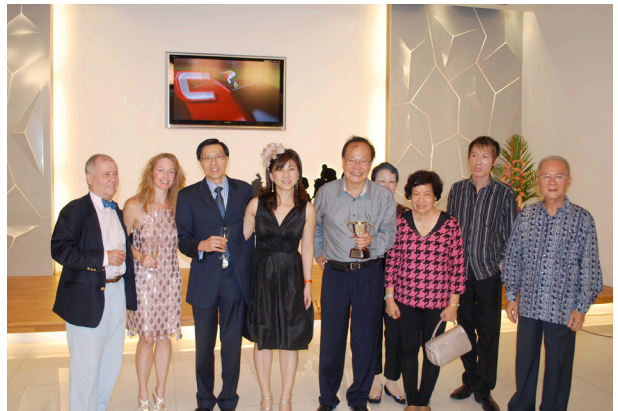
Taking a photo shoot with the winning team